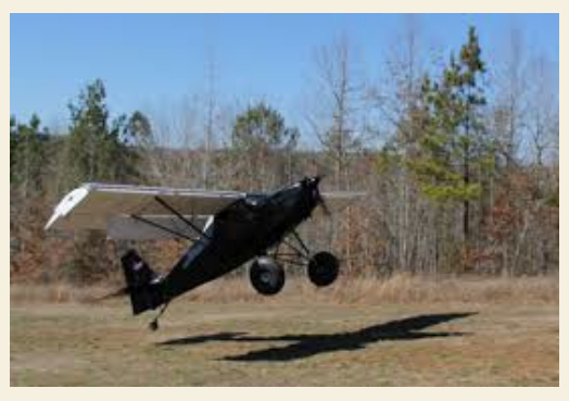
Coming down or going up, ...one really short one!