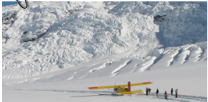
Above: Keeping the ski-plane photos for a while. Pictured here is a ski plane on Mount Cook, South Island, New Zealand.